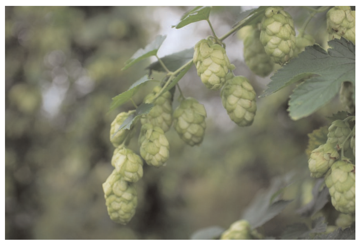
Figure 1. Cones of the Mathon Whitebine variety photographed in 2011 at the National Hop Collection.

When writing about hop growing in Farnham Frederick Shoberl recorded that the Farnham Whitebine was grown from a cutting: