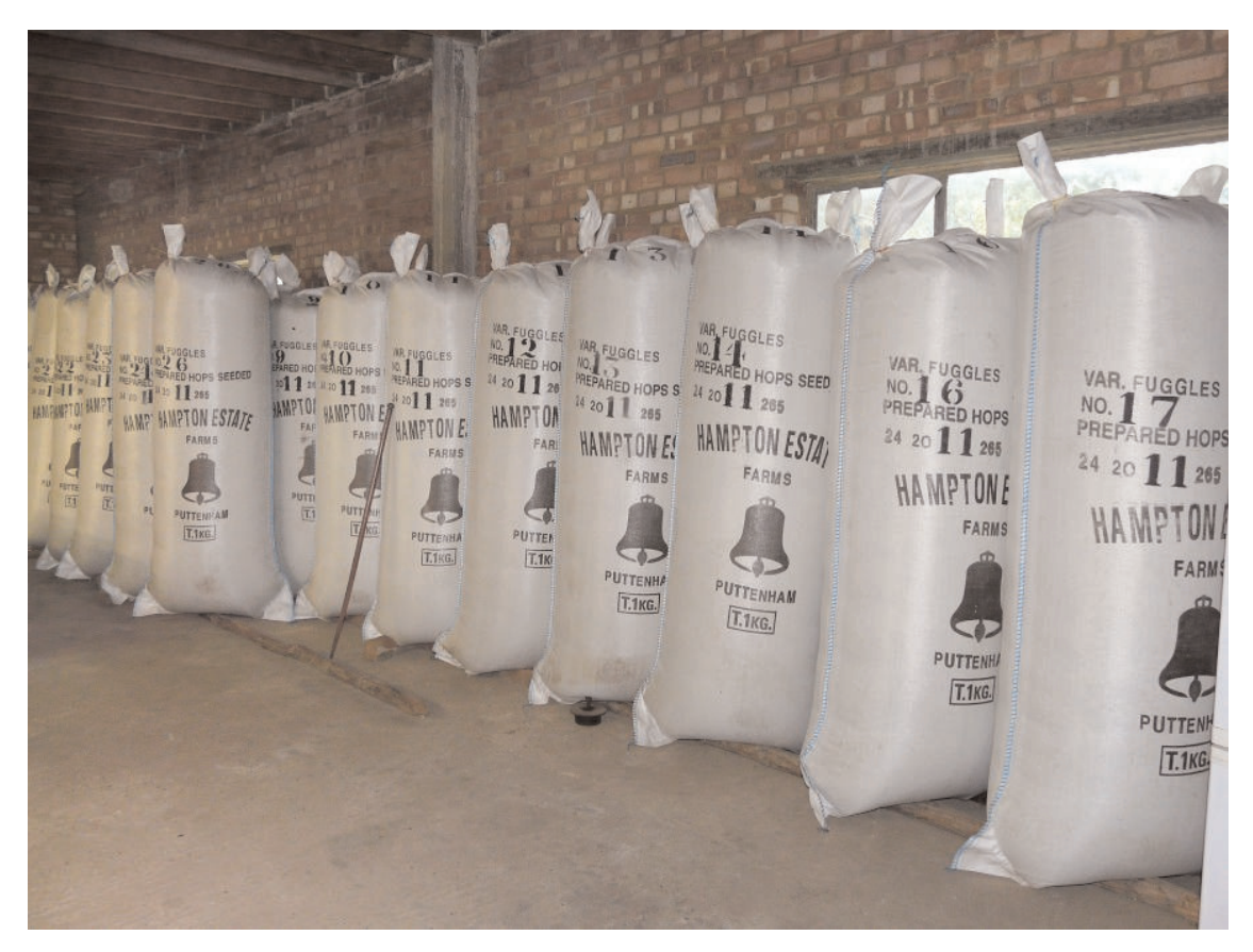
Figure 3. Hop pockets from the 2011 harvest showing the Farnham Bell symbol and marked as the variety Fuggles.

Whitebines held pride of place and were sold from exclusive booths on Blissimore Hall Acre (some of which still stand). Strict quality standards were maintained, and despite being popular with some Farnham farmers a red-bined hop called the 'never-black' was banned from the booths for being too coarse.<sup>24</sup> Fine and delicate soft 'silky hops' were particularly prized by West Country brewers and private gentlemen who would pay a premium price for them.