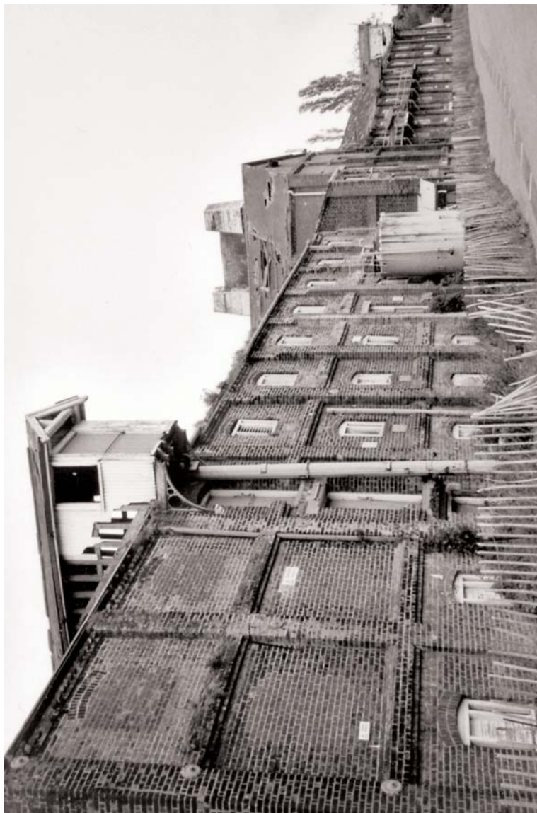
View of the whole length of premises, derelict since about early 1970s. This shows how the three central kilns in effect worked two growing floor buildings. The pipe beside nearest lucam is suction feed for barley intake.