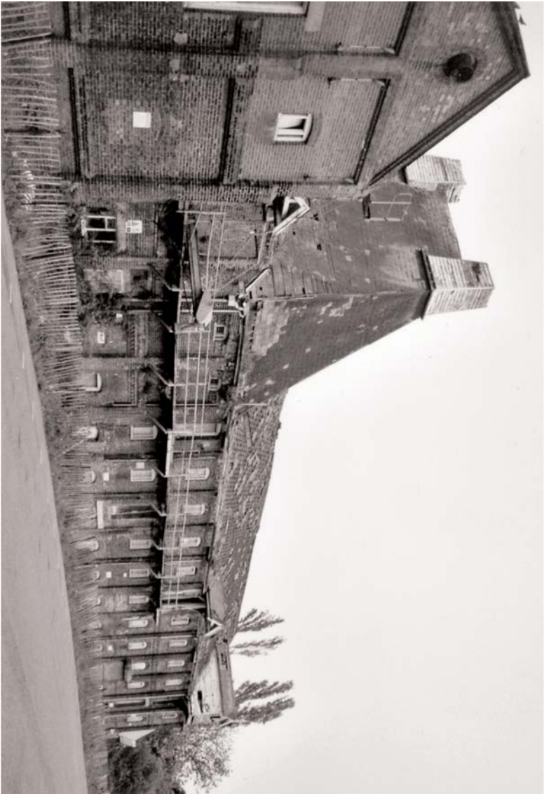
Double kiln flues and automatic spent grains discharge from external walkway. Note the two styles of lucam.