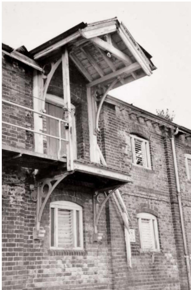
Free Rodwell & Co Ltd. Detail of lucam and its spandrels; sacks were lifted up via the intact loop on cross beam of roof. Previous access to external landing and lucam, stairs demolished to right, handrail partially remains. Note contrasting brickwork and window details.