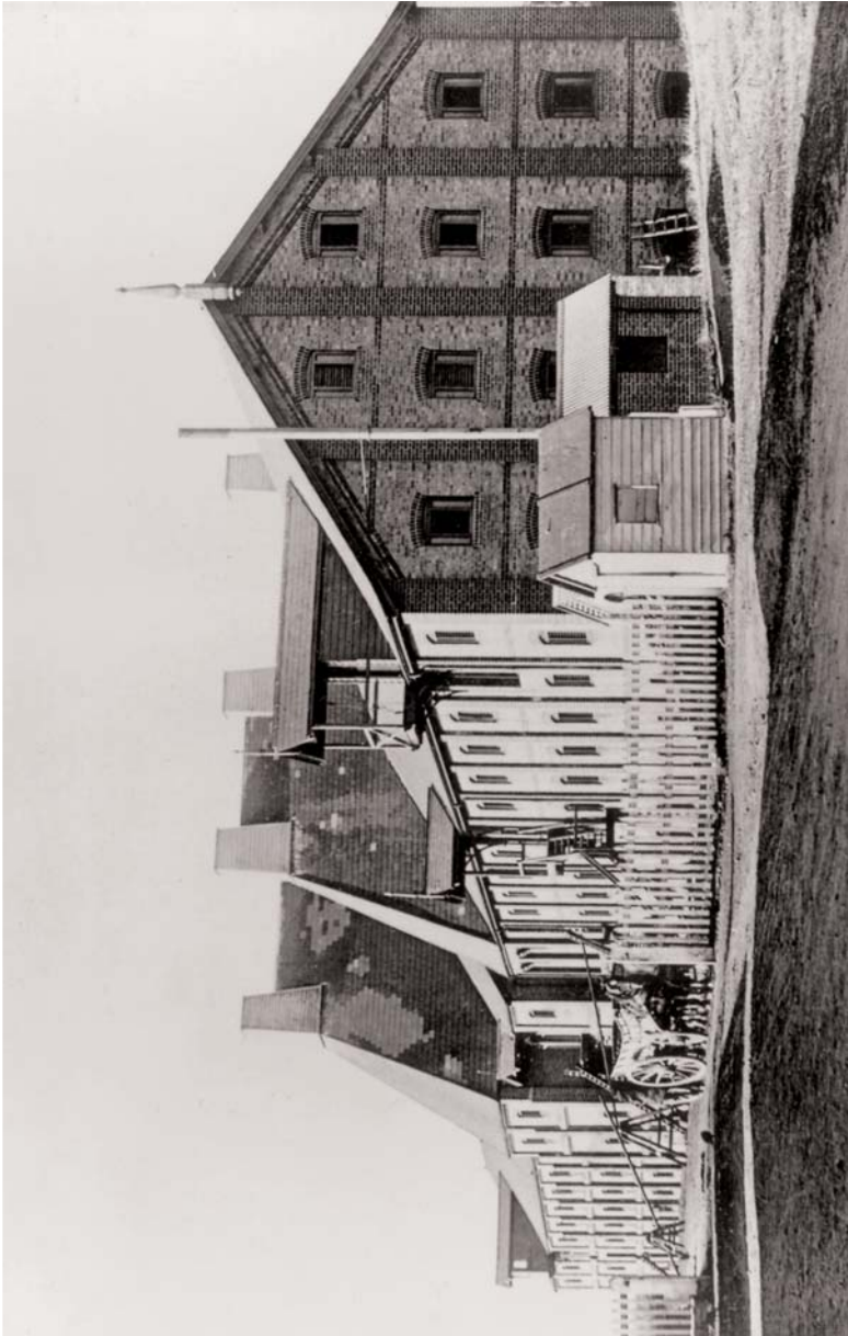
Free, Rodwell & Co Ltd Malting beside the railway station, taken over by Ind Coope / Albrew malsters. View c. 1890s