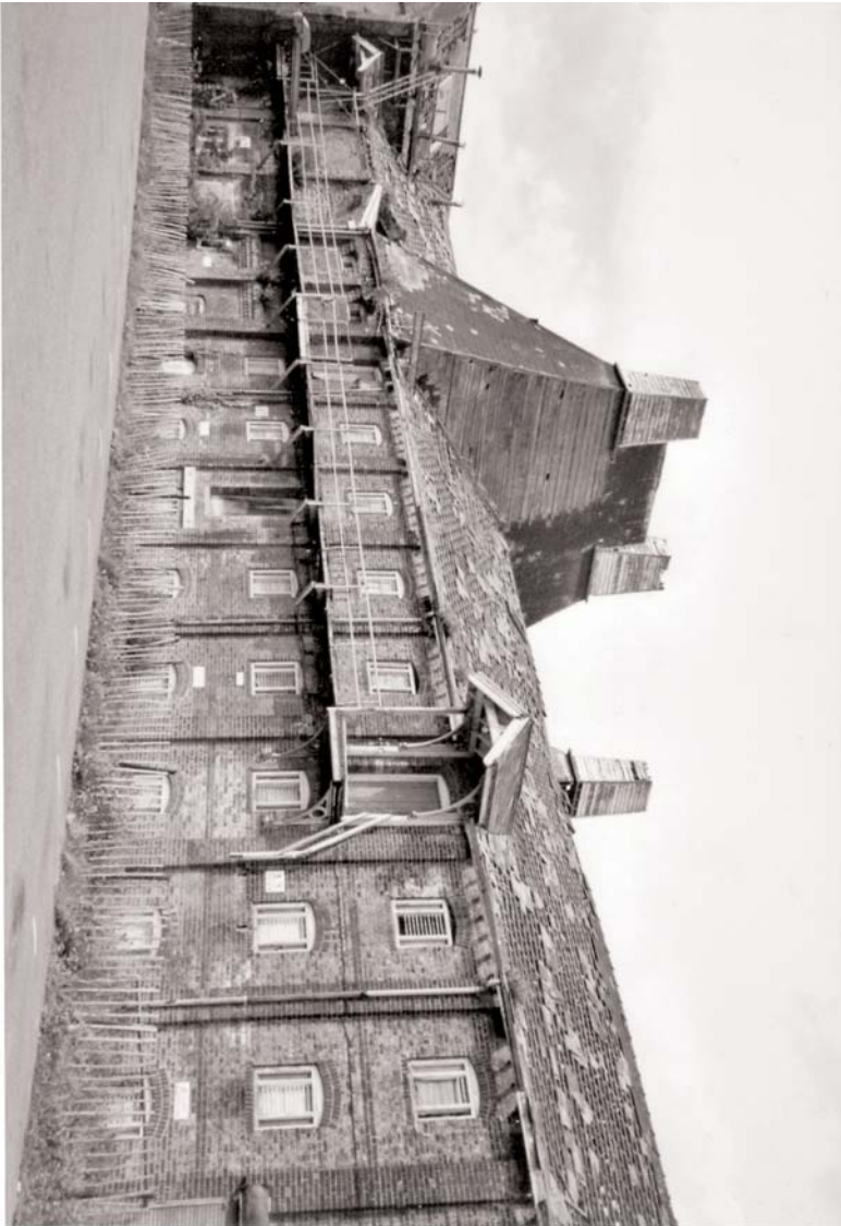
Rail sidings of goods yard formerly in front, now a car park for commuters to London. Closed since at least the early 1970s.